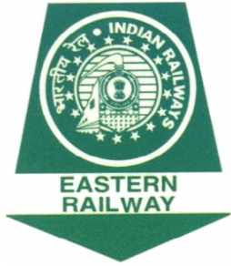
Eastern Railway, Liluah