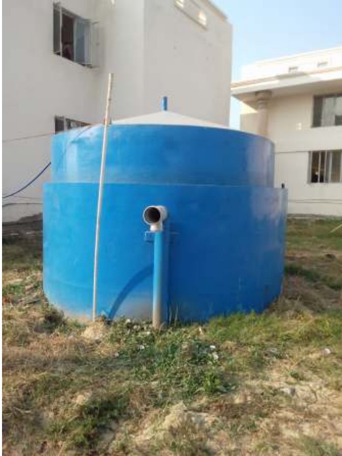
Bio Gas Plant | Rajgir, Bihar