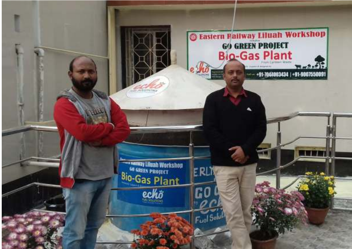
Bio Gas Plant | Howrah, West Bengal