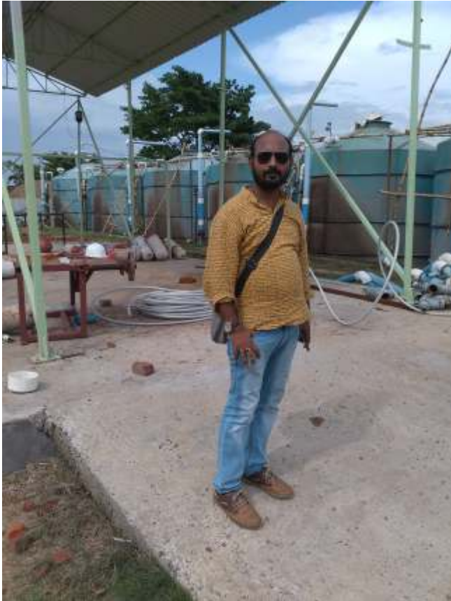
Bio CBG/CNG Plant | West Bengal