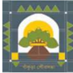
Bankura Municipality, Bankura