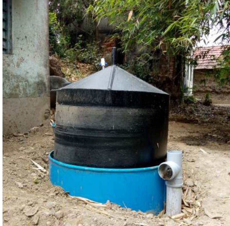
Bio Gas Plant | Singur, West Bengal