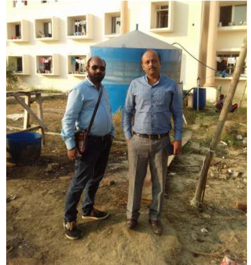
Bio Gas Plant | Rajgir, Bihar