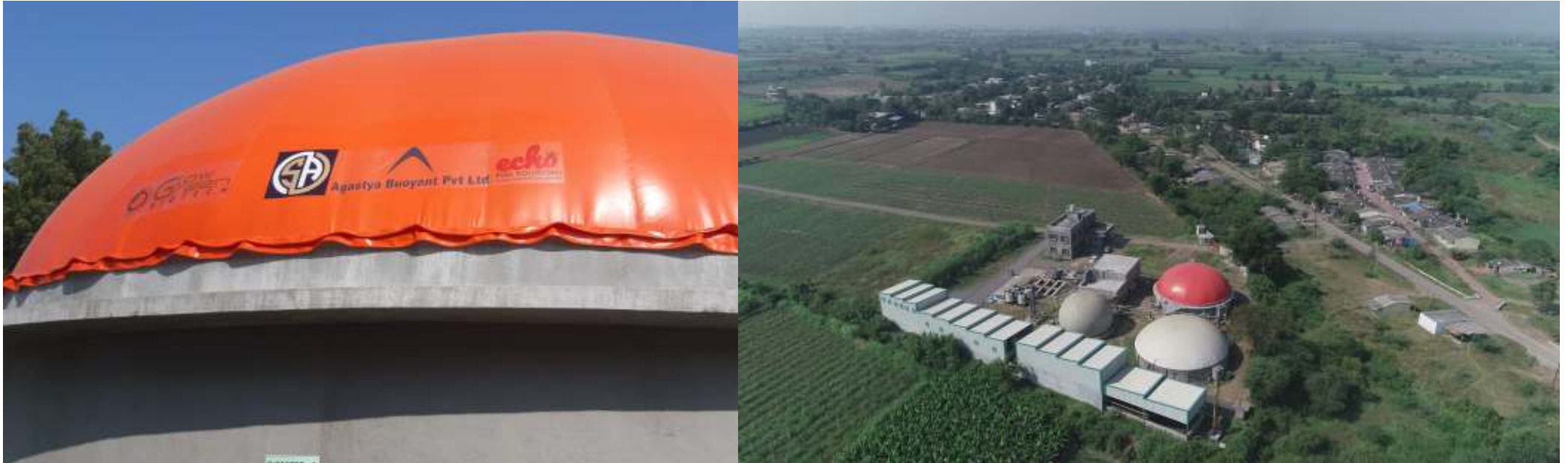
Bio Gas Balloon Installation | Surat, Gujrat