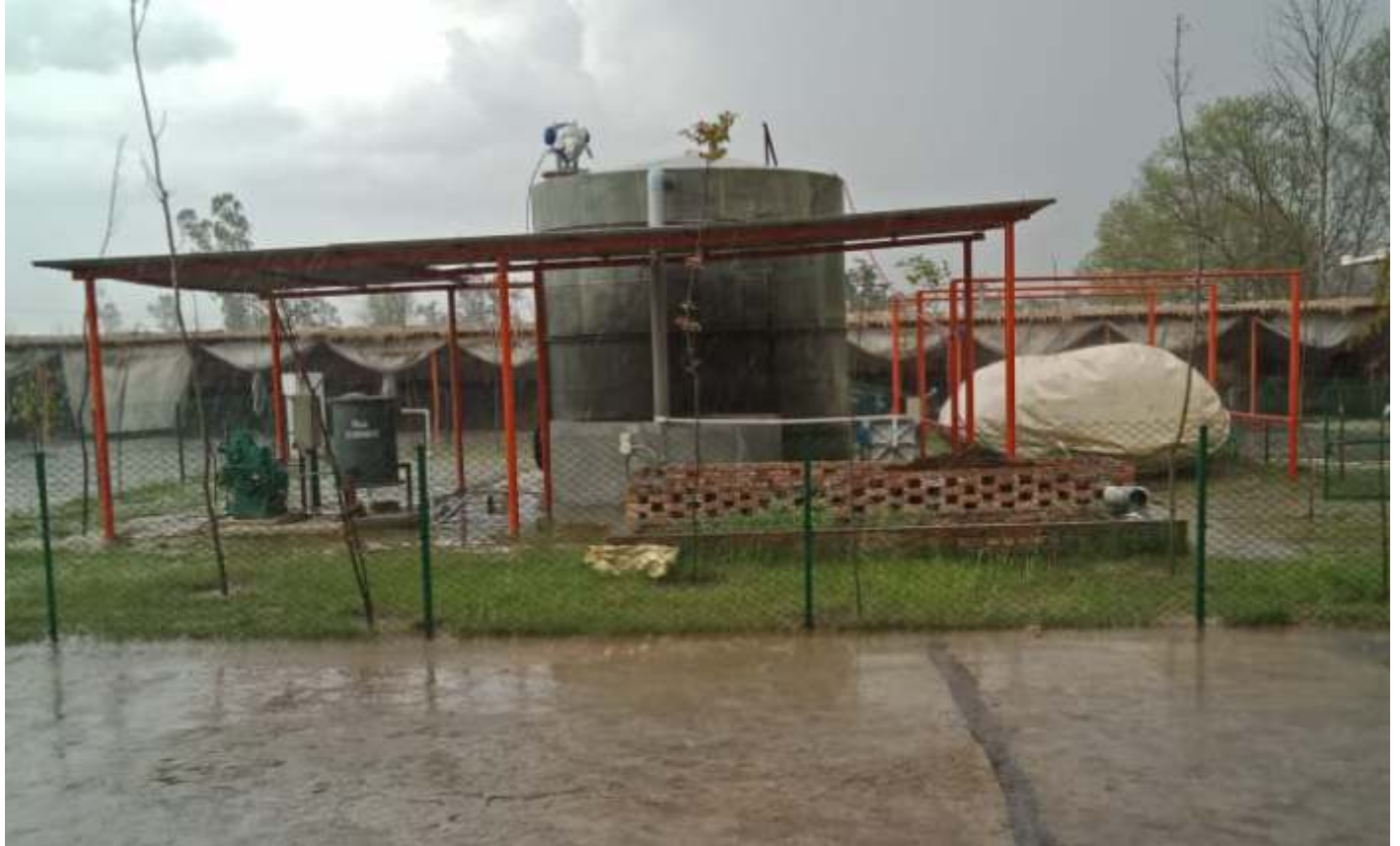
Biogas Power Plant, Uttar Pradesh