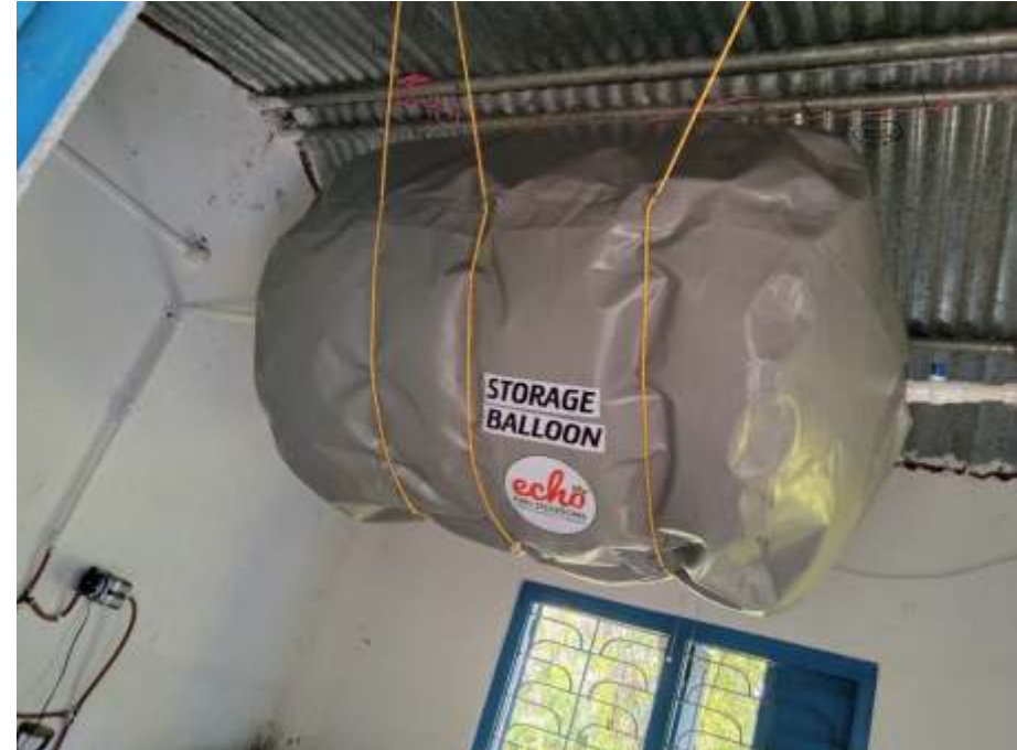
Bio Gas Plant Installation | Radhapur Gram Panchayat, W.B.