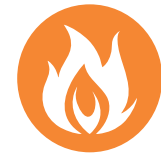
TRILOYITA BIO CNG PRIVATE LIMITED For better miles to cover